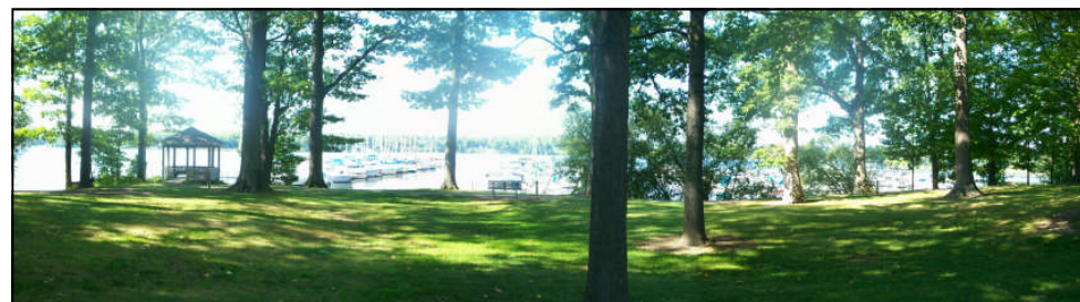
No leaves on the trees yet, but not far off!